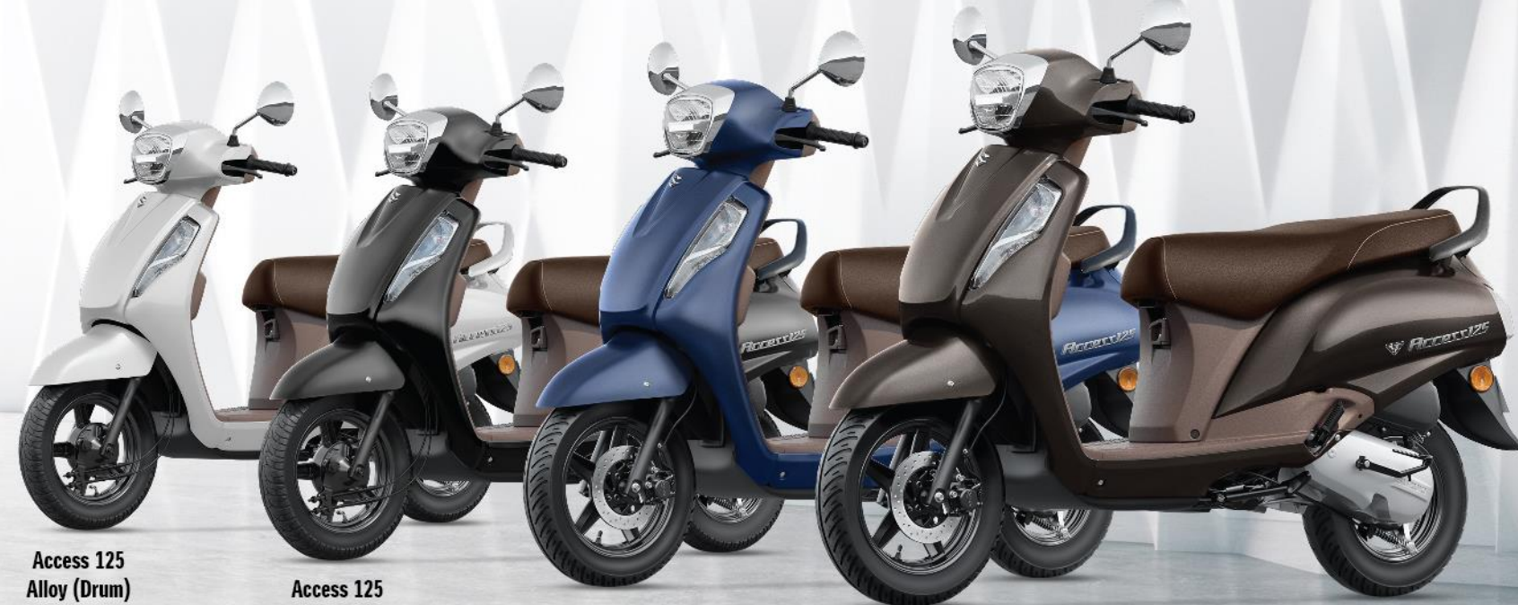
Access 125 Alloy (Drum)